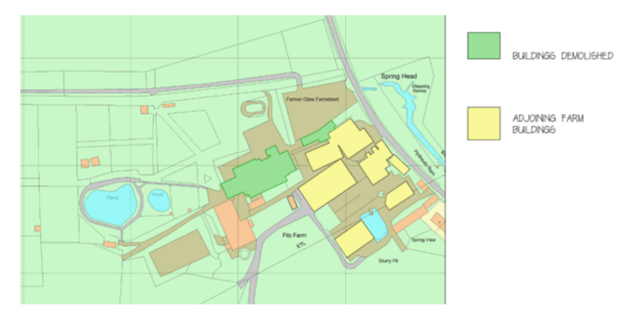
Plan showing buildings to be demolished

The proposed dwelling would be sited on presently open land to the north of the existing main exhibit building. Although an outline application, the scale parameters of the building are for consideration now. The drawings indicate a two storey house of some 600 sq m (including garaging), with ridge height of 9.2m. Siting is indicated to be approximately 100m from the public highway, beyond the central tree group which is indicated to be retained. In view of the change in levels across the site, the dwelling would be cut into the ground.